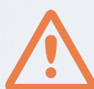
Stage 3 High Alert