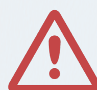
Stage 4 Situation Critical

Depending on the circumstances, if after reaching Stage 4 a DTI's viability is still in serious doubt or its insolvency is imminent, OSFI may take control. This could mean either temporary control of just the assets, or permanent control of the entire Canadian DTI or of the Canadian assets of a foreign bank branch. Taking permanent control usually lasts only as long as it takes to put a lasting solution in place, such as a winding-up order.