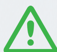
Stage 1 Early Warning

OSFI staff supervise approximately 140 banks, trust companies and loan companies, both those headquartered in Canada as well as foreign banks operating here. Collectively these are known as deposit-taking institutions, or DTIs. If concerns arise about the financial position or operations of a DTI, OSFI can assign it a stage rating on a scale from Stage 1 (Early Warning) to Stage 4 (Non-Viability/Insolvency Imminent).