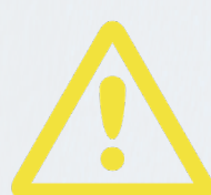
Stage 2 Moderate Alert